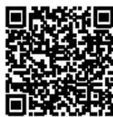
Parent and Carer